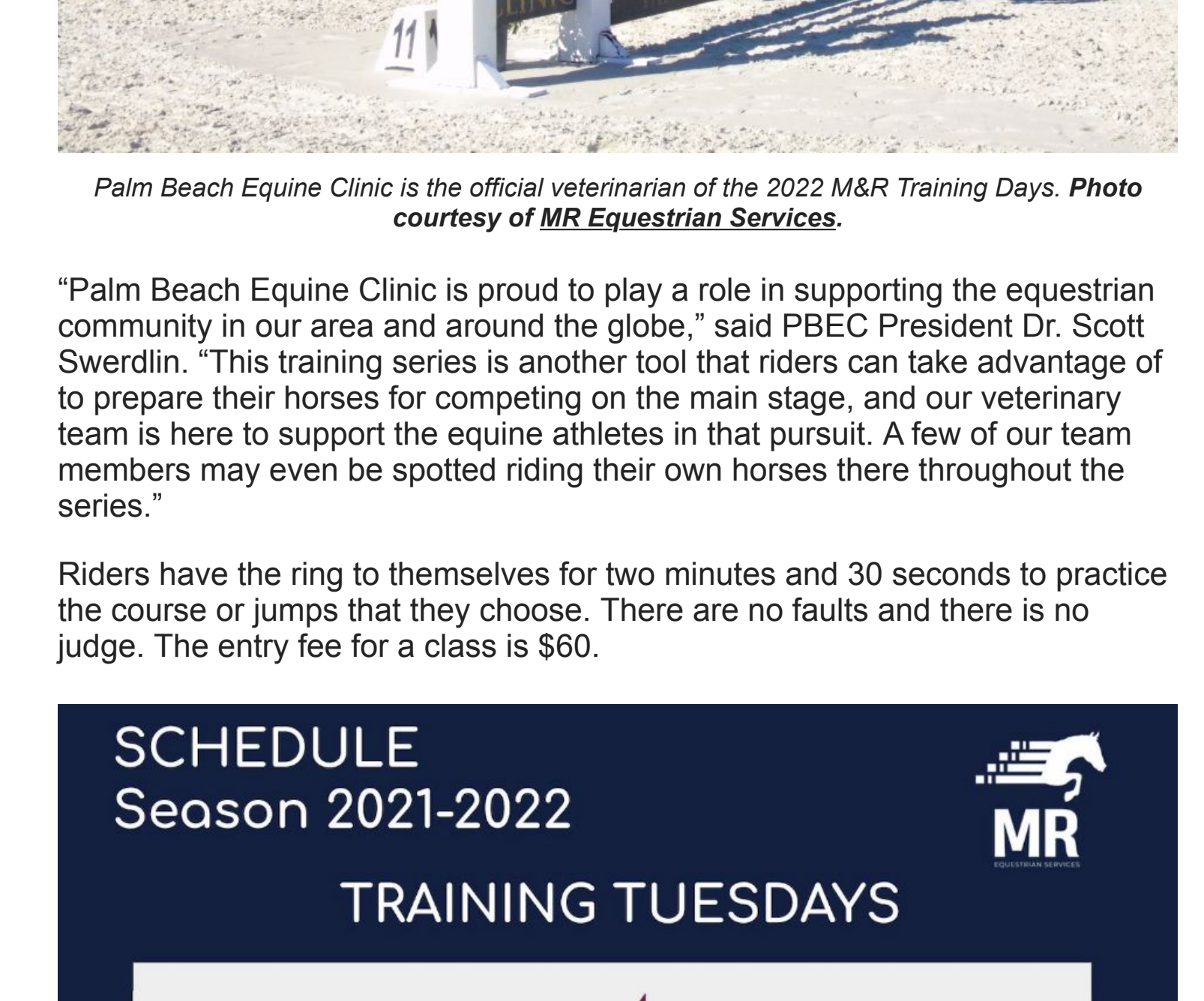
10:30 - 11:00am 12:00 - 12:30am Drag break Drag break 12:30 - 1:30pm 11:00 - 1:30pm

young horses, gain confidence, practice horse show elements, and have fun at